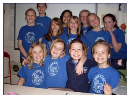
The victorious Morgans female athletes!!!

Some superb performances last Thursday, saw the Morgans boys team finish second in the Hertford and Ware area final, narrowly pipped to first by just 4 points! The girls team however went one better and managed to win!!! This means the Morgans girls will advance to represent the area in the county final at Wodson Park on the 28 th April. Well done to all members of both teams for flying the Morgans flag so well and producing such excellent performances. We will try to ensure some action pictures feature along with a report as to how the girls fare in the Morgans Mail that week.