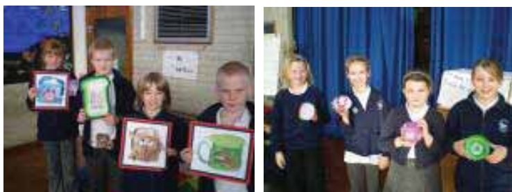
Contain yourselves Year 5!!!