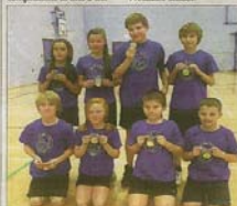
MAGNIFICENT MORGANS: The Morgans School pupils came out on top in the primary event of the Hertford and Ware School Sports Partnership basketball competition.

THREE schools were cock-a-hoop after triumphing at the Hertford and Ware School Sports Partnership basketball competition. As part of the national School Games, the partnership held three basketball competitions in total a week-